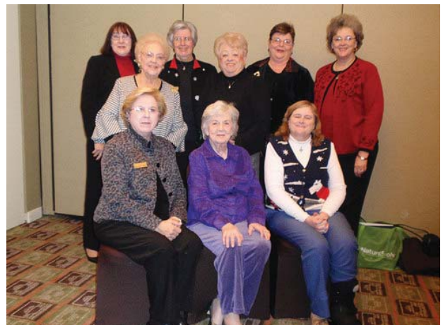
Past Club Presidents