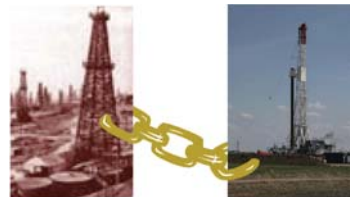
Sharing a Golden Link of Knowledge