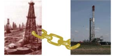
Sharing a Golden Link of Knowledge

Laughter of Lilacs Rainbows of roses Songs of the robins Lily of the valley borders Sunshine to warm the heart Oh what joy this season does impart!