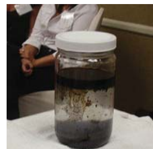
Oil particles rise to the top